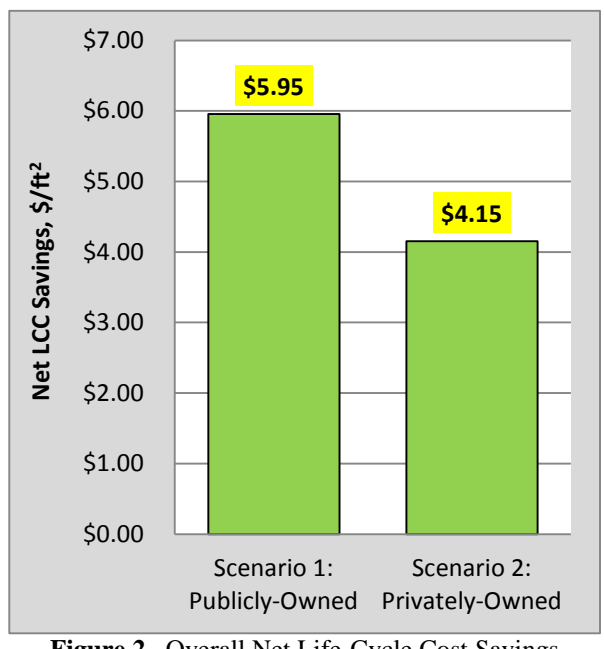
Figure 2. Overall Net Life-Cycle Cost Savings