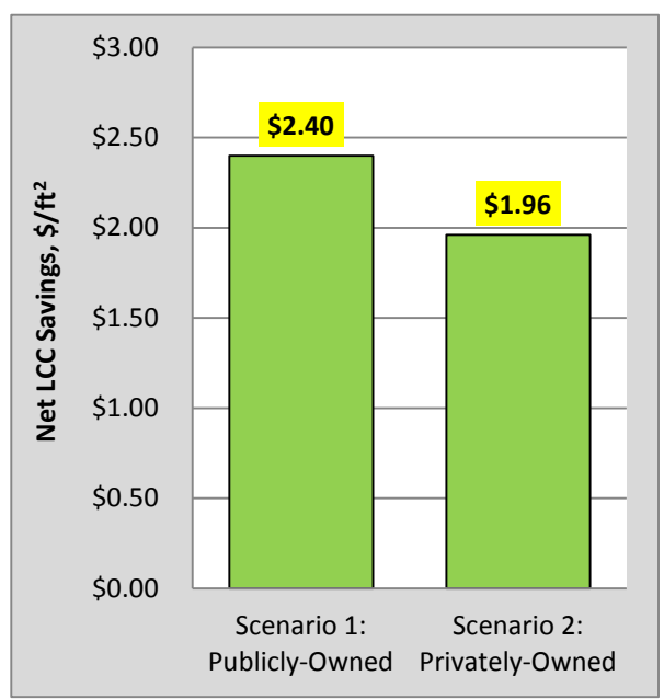
Figure 2. Overall Net Life-Cycle Cost Savings