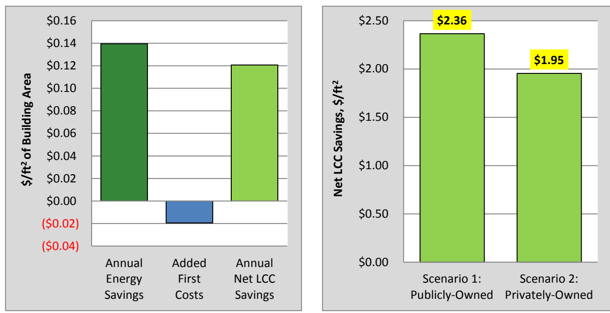
Figure 1 compares annual energy cost savings, first cost for the upgrade, and net annualized LCC savings. The net annualized LCC savings per square foot is the annual energy savings plus the annualized value of first cost savings under scenario 1. Figure 2 shows overall state weighted net LCC results for both scenarios. When net LCC is positive, the updated code edition is considered cost-effective.