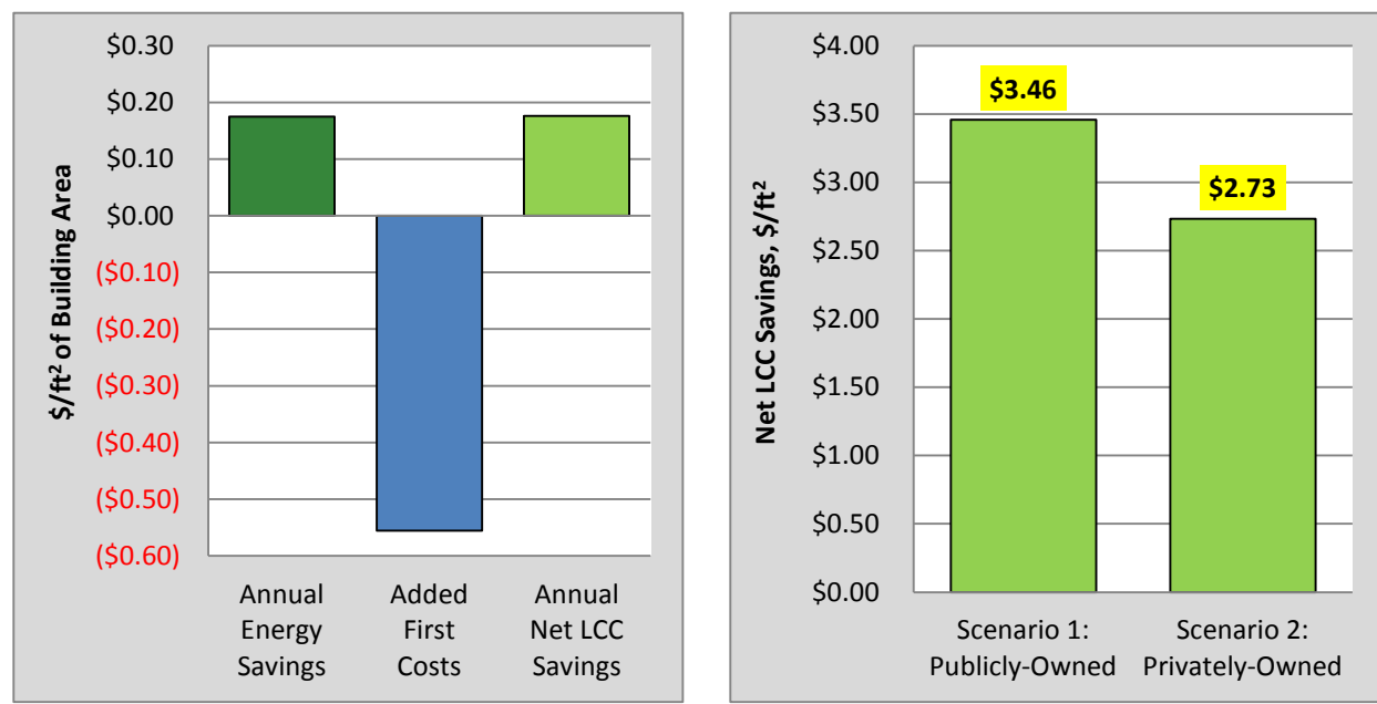
Figure 1 compares annual energy cost savings, first cost for the upgrade, and net annualized LCC savings. The net annualized LCC savings per square foot is the annual energy savings plus the annualized value of first cost savings under scenario 1. Figure 2 shows overall state weighted net LCC results for both scenarios. When net LCC is positive, the updated code edition is considered cost-effective.