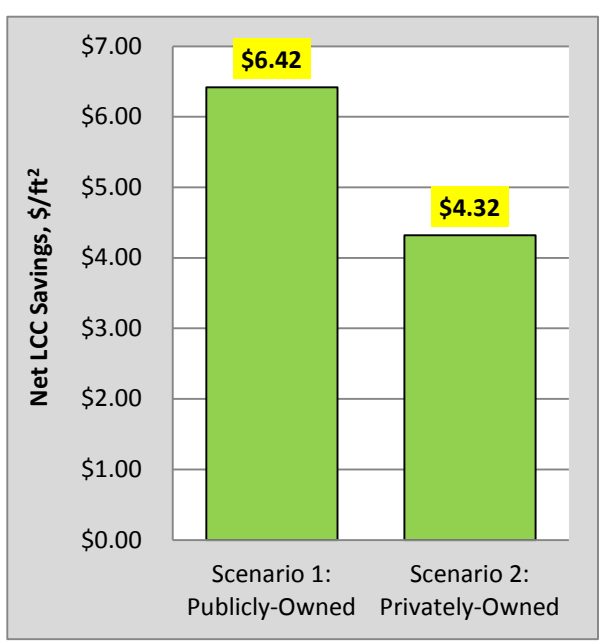
Figure 2. Overall Net Life-Cycle Cost Savings