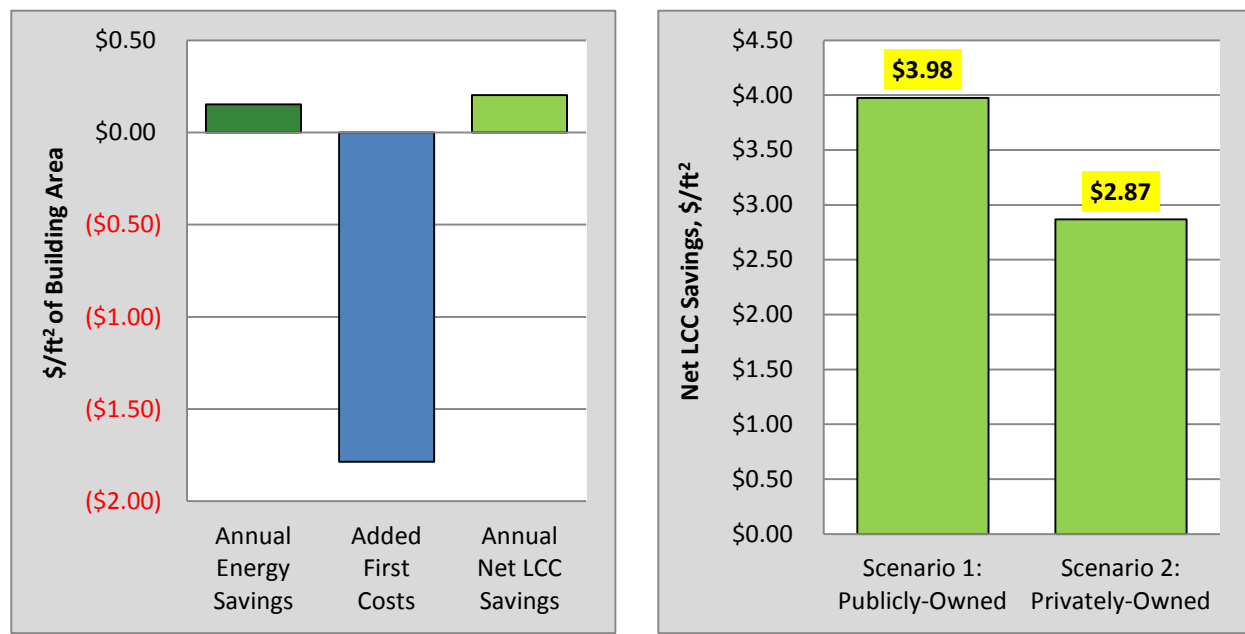
Figure 1 compares annual energy cost savings, first cost for the upgrade, and net annualized LCC savings. The net annualized LCC savings per square foot is the annual energy savings plus the annualized value of first cost savings under scenario 1. Figure 2 shows overall state weighted net LCC results for both scenarios. When net LCC is positive, the updated code edition is considered cost-effective.