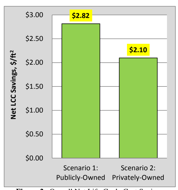
Figure 2. Overall Net Life-Cycle Cost Savings