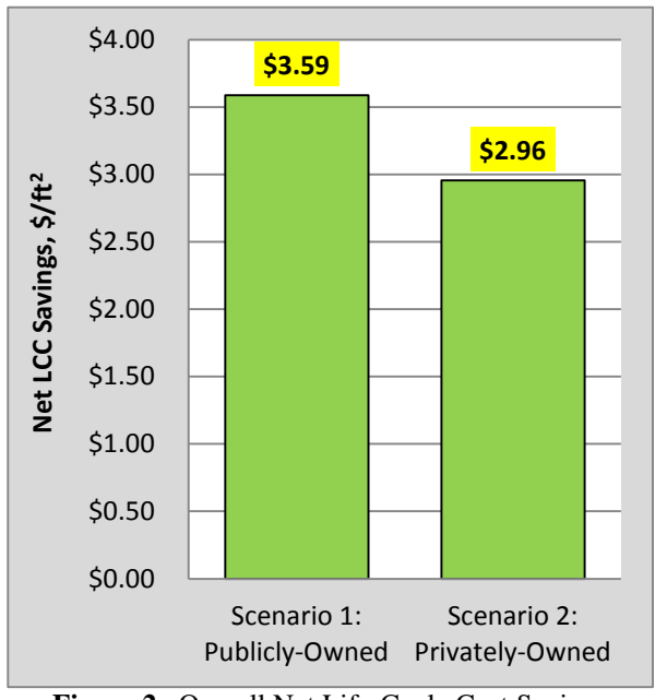
Figure 2. Overall Net Life-Cycle Cost Savings