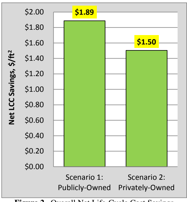
Figure 2. Overall Net Life-Cycle Cost Savings