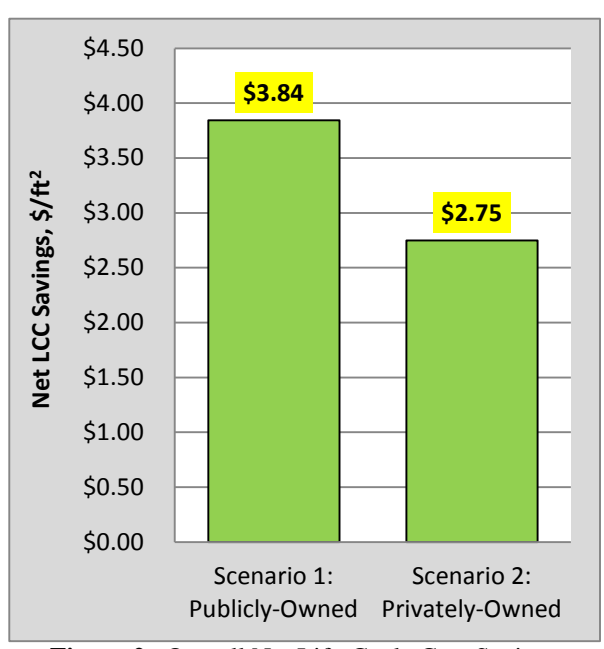
Figure 2. Overall Net Life-Cycle Cost Savings