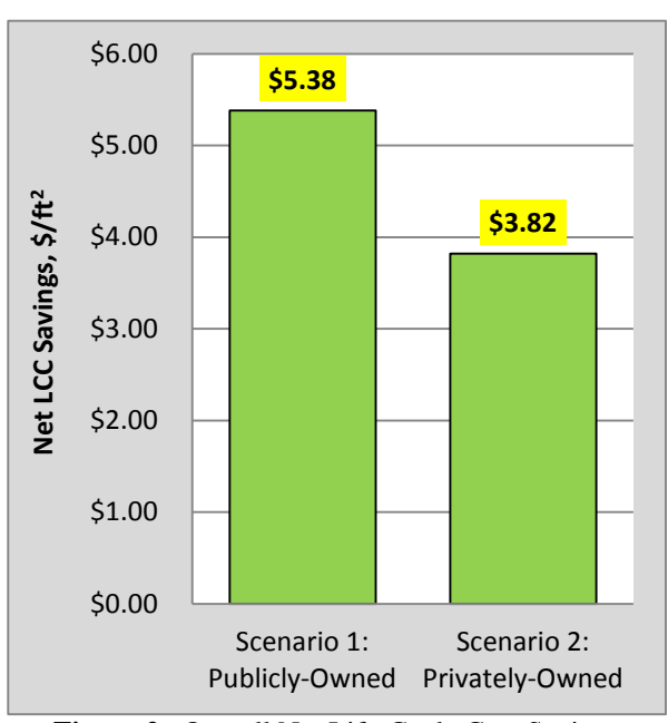
Figure 2. Overall Net Life-Cycle Cost Savings