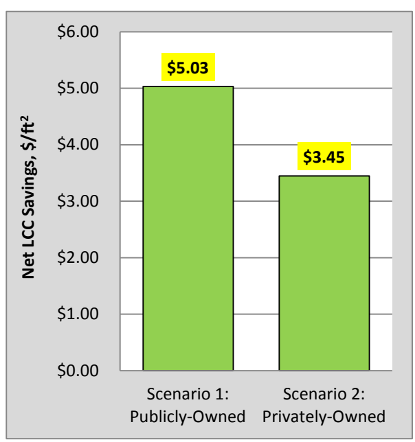
Figure 2. Overall Net Life-Cycle Cost Savings