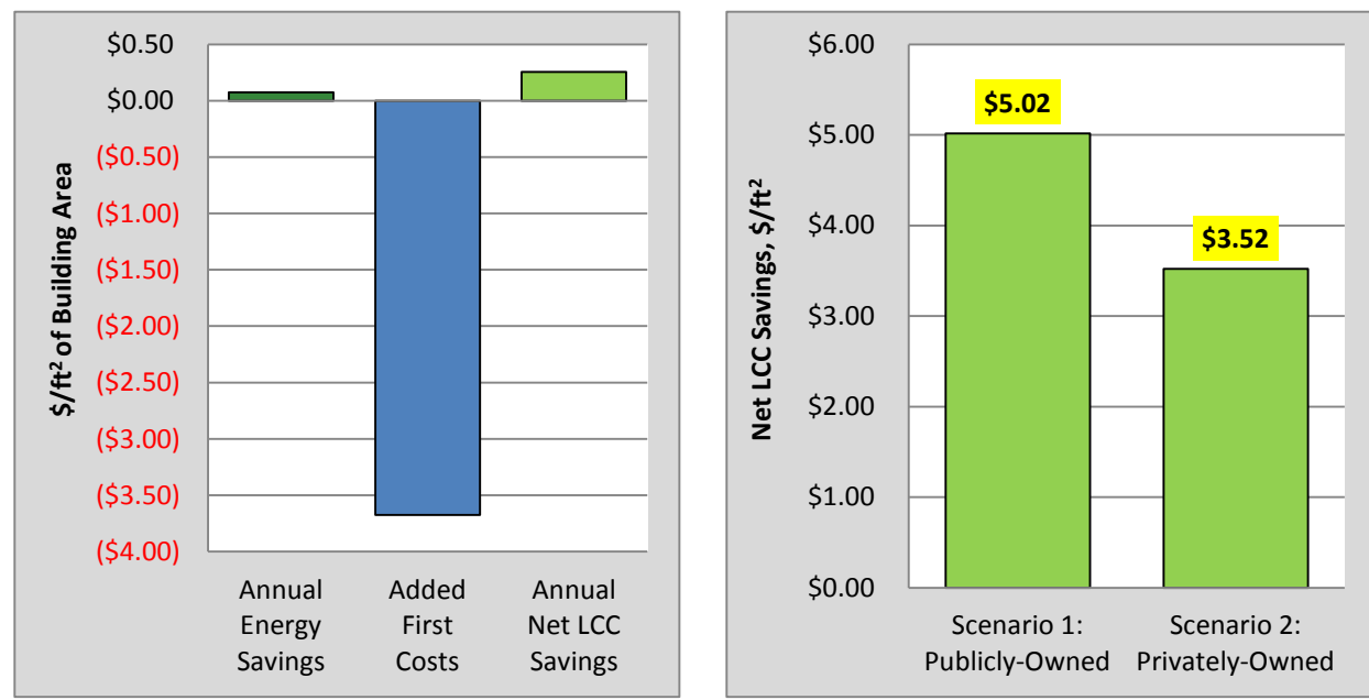
Figure 1 compares annual energy cost savings, first cost for the upgrade, and net annualized LCC savings. The net annualized LCC savings per square foot is the annual energy savings plus the annualized value of first cost savings under scenario 1. Figure 2 shows overall state weighted net LCC results for both scenarios. When net LCC is positive, the updated code edition is considered cost-effective.