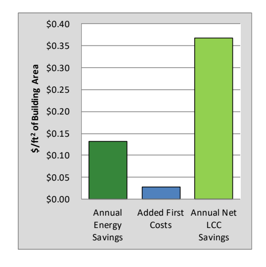
Figure 1 compares annual energy cost savings, first cost for the upgrade, and net annualized LCC savings. The net annualized LCC savings per square foot is the annual energy savings minus an allowance to pay for the added cost under scenario 1. Figure 2 shows overall state weighted net LCC results for both scenarios. When net LCC is positive, the updated code edition is considered cost-effective.