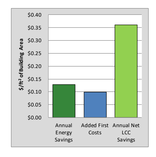
Figure 1 compares annual energy cost savings, first cost for the upgrade, and net annualized LCC savings. The net annualized LCC savings per square foot is the annual energy savings minus an allowance to pay for the added cost under scenario 1. Figure 2 shows overall state weighted net LCC results for both scenarios. When net LCC is positive, the updated code edition is considered cost-effective.