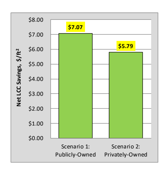
Figure 1. Statewide Weighted Costs and Savings Figure 2. Overall Net Life-Cycle Cost Savings