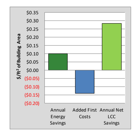
Figure 1 compares annual energy cost savings, first cost for the upgrade, and net annualized LCC savings. The net annualized LCC savings per square foot is the annual energy savings minus an allowance to pay for the added cost under scenario 1. Figure 2 shows overall state weighted net LCC results for both scenarios. When net LCC is positive, the updated code edition is considered cost-effective.