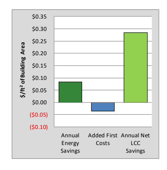
Figure 1 compares annual energy cost savings, first cost for the upgrade, and net annualized LCC savings. The net annualized LCC savings per square foot is the annual energy savings minus an allowance to pay for the added cost under scenario 1. Figure 2 shows overall state weighted net LCC results for both scenarios. When net LCC is positive, the updated code edition is considered cost-effective.