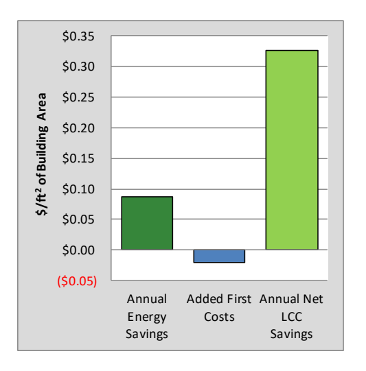
Figure 1 compares annual energy cost savings, first cost for the upgrade, and net annualized LCC savings. The net annualized LCC savings per square foot is the annual energy savings minus an allowance to pay for the added cost under scenario 1. Figure 2 shows overall state weighted net LCC results for both scenarios. When net LCC is positive, the updated code edition is considered cost-effective.