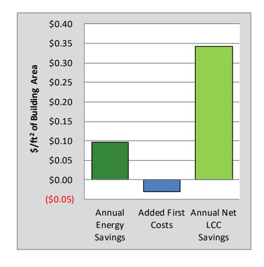
Figure 1 compares annual energy cost savings, first cost for the upgrade, and net annualized LCC savings. The net annualized LCC savings per square foot is the annual energy savings minus an allowance to pay for the added cost under scenario 1. Figure 2 shows overall state weighted net LCC results for both scenarios. When net LCC is positive, the updated code edition is considered cost-effective.