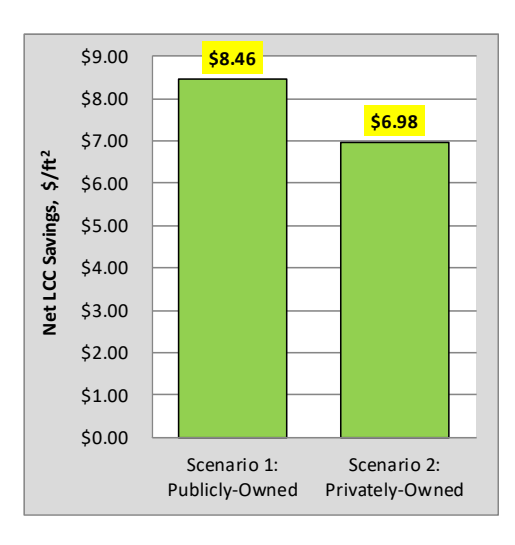
Figure 1. Statewide Weighted Costs and Savings