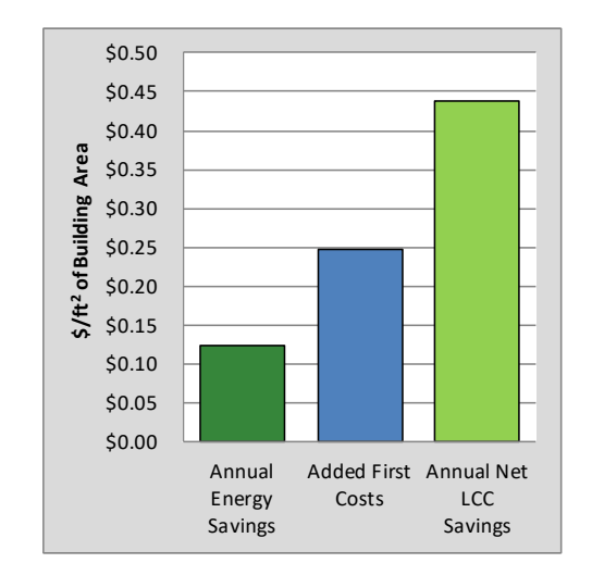
Figure 1 compares annual energy cost savings, first cost for the upgrade, and net annualized LCC savings. The net annualized LCC savings per square foot is the annual energy savings minus an allowance to pay for the added cost under scenario 1. Figure 2 shows overall state weighted net LCC results for both scenarios. When net LCC is positive, the updated code edition is considered cost-effective.