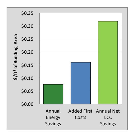
Figure 1. Statewide Weighted Costs and Savings

Figure 1 compares annual energy cost savings, first cost for the upgrade, and net annualized LCC savings. The net annualized LCC savings per square foot is the annual energy savings minus an allowance to pay for the added cost under scenario 1. Figure 2 shows overall state weighted net LCC results for both scenarios. When net LCC is positive, the updated code edition is considered cost-effective.