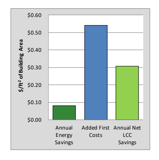
Figure 1 compares annual energy cost savings, first cost for the upgrade, and net annualized LCC savings. The net annualized LCC savings per square foot is the annual energy savings minus an allowance to pay for the added cost under scenario 1. Figure 2 shows overall state weighted net LCC results for both scenarios. When net LCC is positive, the updated code edition is considered cost-effective.