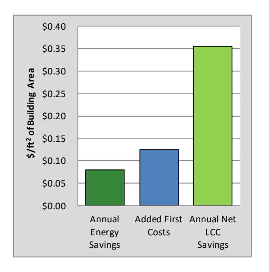
Figure 1. Statewide Weighted Costs and Savings

Figure 1 compares annual energy cost savings, first cost for the upgrade, and net annualized LCC savings. The net annualized LCC savings per square foot is the annual energy savings minus an allowance to pay for the added cost under scenario 1. Figure 2 shows overall state weighted net LCC results for both scenarios. When net LCC is positive, the updated code edition is considered cost-effective.