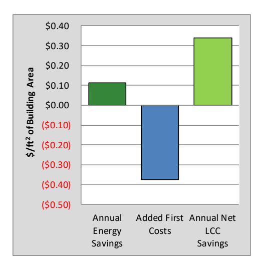
Figure 1 compares annual energy cost savings, first cost for the upgrade, and net annualized LCC savings. The net annualized LCC savings per square foot is the annual energy savings minus an allowance to pay for the added cost under scenario 1. Figure 2 shows overall state weighted net LCC results for both scenarios. When net LCC is positive, the updated code edition is considered cost-effective.