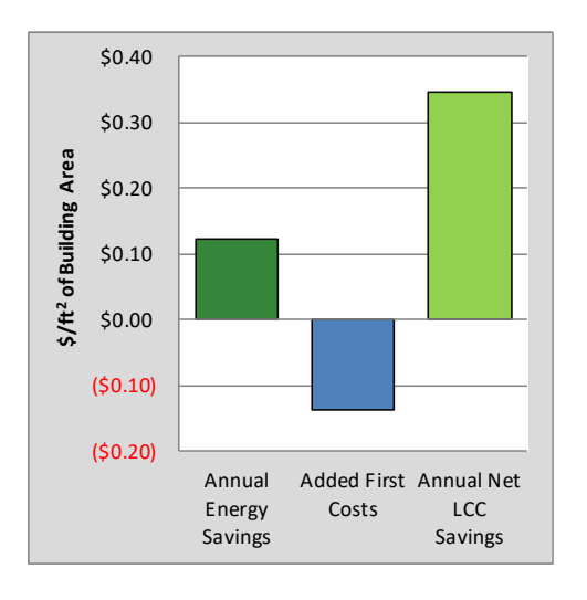
Figure 1 compares annual energy cost savings, first cost for the upgrade, and net annualized LCC savings. The net annualized LCC savings per square foot is the annual energy savings minus an allowance to pay for the added cost under scenario 1. Figure 2 shows overall state weighted net LCC results for both scenarios. When net LCC is positive, the updated code edition is considered cost-effective.