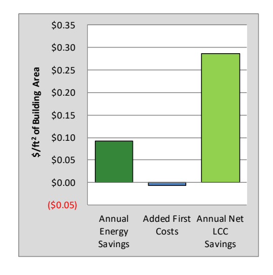
Figure 1 compares annual energy cost savings, first cost for the upgrade, and net annualized LCC savings. The net annualized LCC savings per square foot is the annual energy savings minus an allowance to pay for the added cost under scenario 1. Figure 2 shows overall state weighted net LCC results for both scenarios. When net LCC is positive, the updated code edition is considered cost-effective.