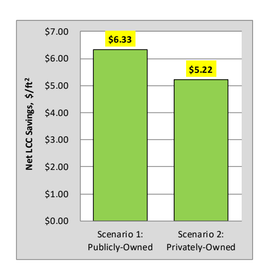
Figure 1. Statewide Weighted Costs and Savings Figure 2. Overall Net Life-Cycle Cost Savings