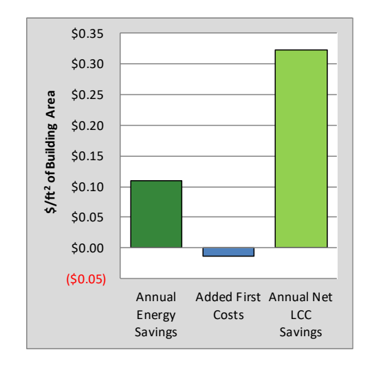
Figure 1 compares annual energy cost savings, first cost for the upgrade, and net annualized LCC savings. The net annualized LCC savings per square foot is the annual energy savings minus an allowance to pay for the added cost under scenario 1. Figure 2 shows overall state weighted net LCC results for both scenarios. When net LCC is positive, the updated code edition is considered cost-effective.