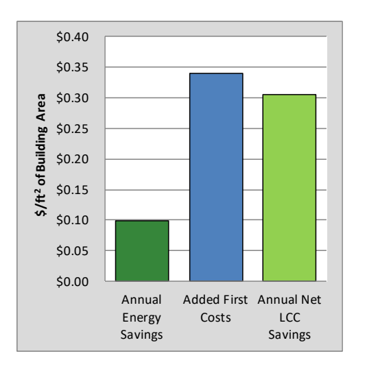
Figure 1. Statewide Weighted Costs and Savings

Figure 1 compares annual energy cost savings, first cost for the upgrade, and net annualized LCC savings. The net annualized LCC savings per square foot is the annual energy savings minus an allowance to pay for the added cost under scenario 1. Figure 2 shows overall state weighted net LCC results for both scenarios. When net LCC is positive, the updated code edition is considered cost-effective.