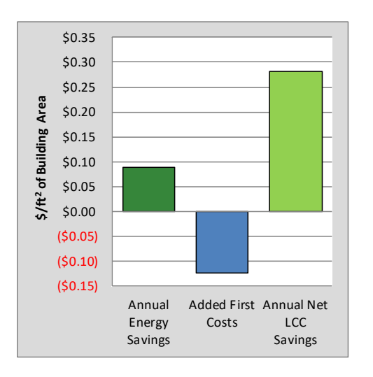
Figure 1 compares annual energy cost savings, first cost for the upgrade, and net annualized LCC savings. The net annualized LCC savings per square foot is the annual energy savings minus an allowance to pay for the added cost under scenario 1. Figure 2 shows overall state weighted net LCC results for both scenarios. When net LCC is positive, the updated code edition is considered cost-effective.