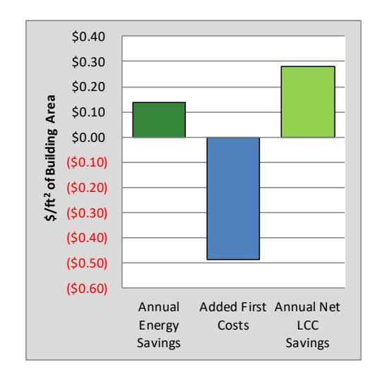
Figure 1 compares annual energy cost savings, first cost for the upgrade, and net annualized LCC savings. The net annualized LCC savings per square foot is the annual energy savings minus an allowance to pay for the added cost under scenario 1. Figure 2 shows overall state weighted net LCC results for both scenarios. When net LCC is positive, the updated code edition is considered cost-effective.