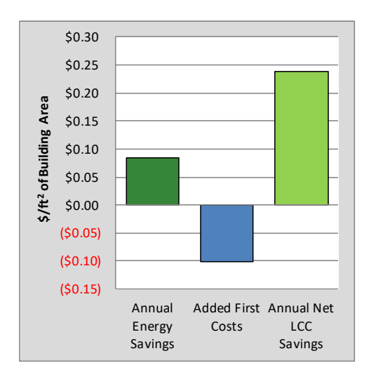
Figure 1. Statewide Weighted Costs and Savings

Figure 1 compares annual energy cost savings, first cost for the upgrade, and net annualized LCC savings. The net annualized LCC savings per square foot is the annual energy savings minus an allowance to pay for the added cost under scenario 1. Figure 2 shows overall state weighted net LCC results for both scenarios. When net LCC is positive, the updated code edition is considered cost-effective.