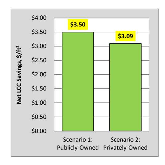
Figure 1. Statewide Weighted Costs and Savings