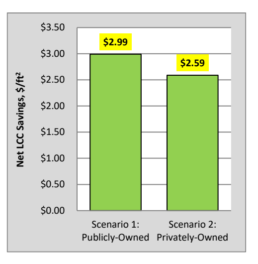
Figure 2. Overall Net Life-Cycle Cost Savings