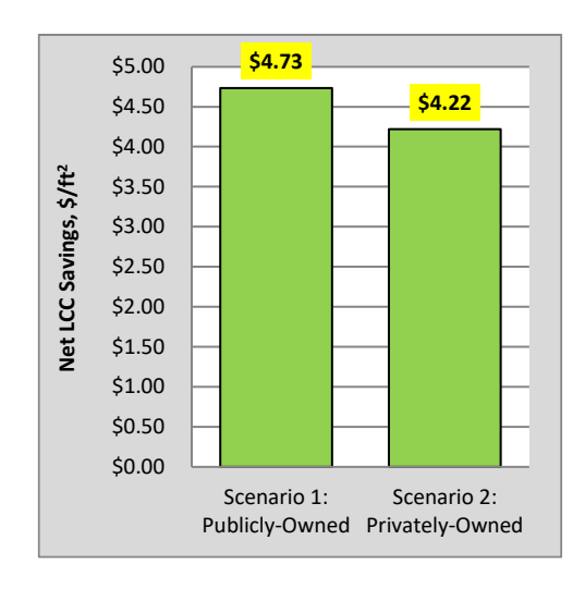
Figure 1. Statewide Weighted Costs and Savings