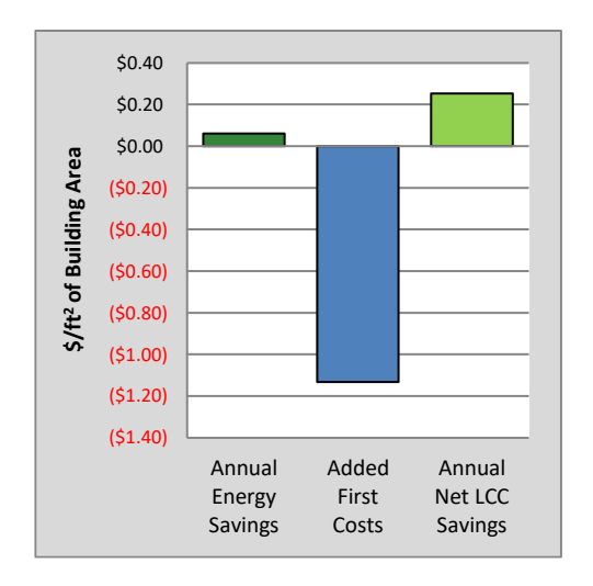
Figure 1 compares annual energy cost savings, first cost for the upgrade, and net annualized LCC savings. The net annualized LCC savings per square foot is the annual energy savings minus an allowance to pay for the added cost under scenario 1. Figure 2 shows overall state weighted net LCC results for both scenarios. When net LCC is positive, the updated code edition is considered cost-effective.