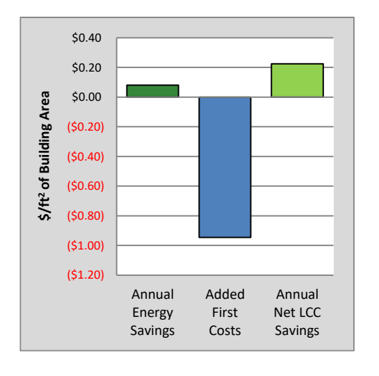
Figure 1 compares annual energy cost savings, first cost for the upgrade, and net annualized LCC savings. The net annualized LCC savings per square foot is the annual energy savings minus an allowance to pay for the added cost under scenario 1. Figure 2 shows overall state weighted net LCC results for both scenarios. When net LCC is positive, the updated code edition is considered cost-effective.