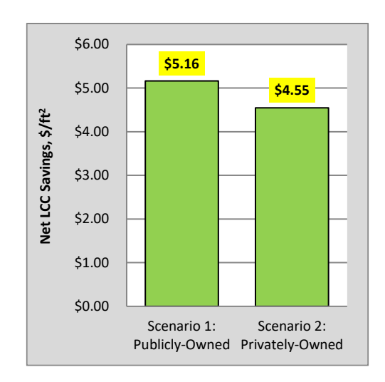
Figure 1. Statewide Weighted Costs and Savings