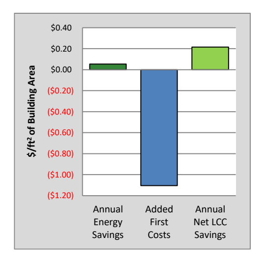
Figure 1 compares annual energy cost savings, first cost for the upgrade, and net annualized LCC savings. The net annualized LCC savings per square foot is the annual energy savings minus an allowance to pay for the added cost under scenario 1. Figure 2 shows overall state weighted net LCC results for both scenarios. When net LCC is positive, the updated code edition is considered cost-effective.