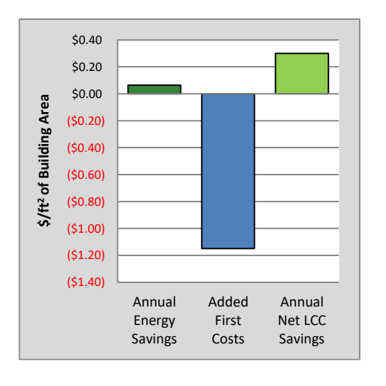
Figure 1 compares annual energy cost savings, first cost for the upgrade, and net annualized LCC savings. The net annualized LCC savings per square foot is the annual energy savings minus an allowance to pay for the added cost under scenario 1. Figure 2 shows overall state weighted net LCC results for both scenarios. When net LCC is positive, the updated code edition is considered cost-effective.