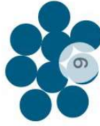
Home Builder Association sponsored trainings