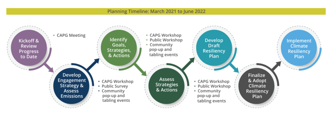
Figure 24: Planning timeline

strategic planning process; as that process unfolded, the city recognized that a more collaborative effort would be needed. In November 2019, the city engaged Cascadia Consulting Group to work with a recently formed community volunteer group, the Climate Action Planning Group (CAPG), in a joint process to develop recommendations that would become City of Port Angeles Climate Resiliency Plan. Refer to Figure 24 for planning timeline.